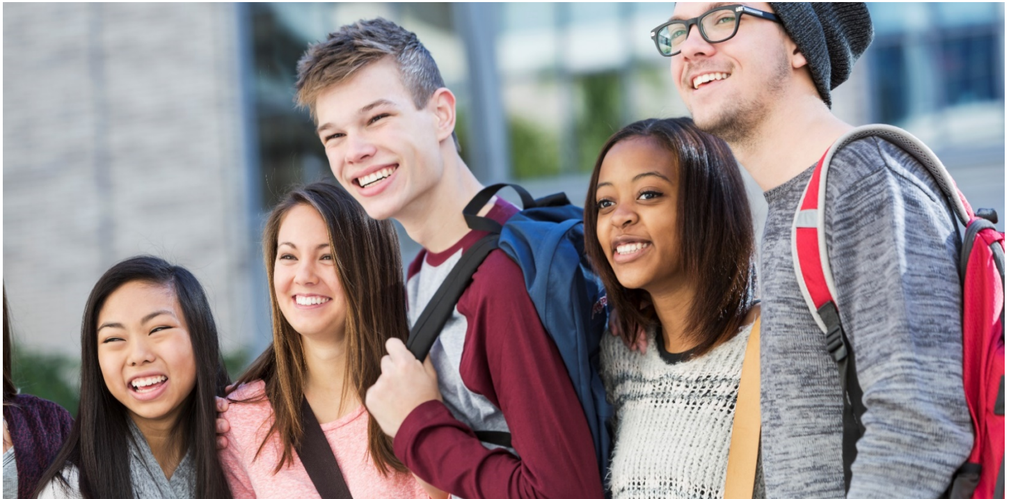
Photo is for illustrative purposes only. Any person depicted in this photo is a model.

Compiled by: The EPINET National Data Coordinating Center (ENDCC) Westat An Employee-Owned Research Corporation® 1600 Research Boulevard Rockville, Maryland 20850-3129 ENDCC@westat.com